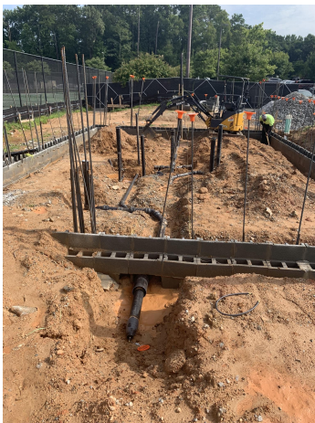
CSK- Concession CMU Foundation Prep