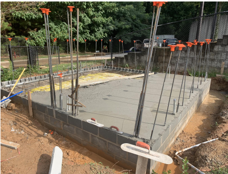
CSK- Storage Slab Pour

Contractor: CD Moody Construction Company