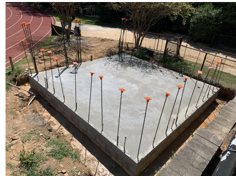
CSK- Storage Slab Pour